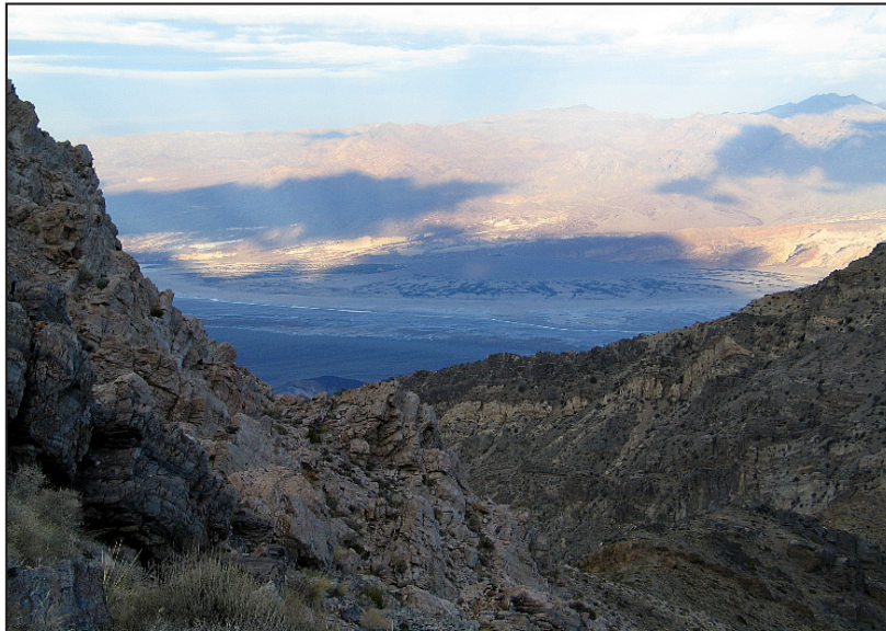
Zabriskie Point in Death Valley

Being sick or having a major problem in your life is a pain in the neck. This is because, in large part, any situation that negatively impacts your life forces you to think about it , rather than more pleasant things. That is why this card is designed to take your mind off your troubles , at least for a while. It is also a way you can share this diversion with family and friends who need a boost today.